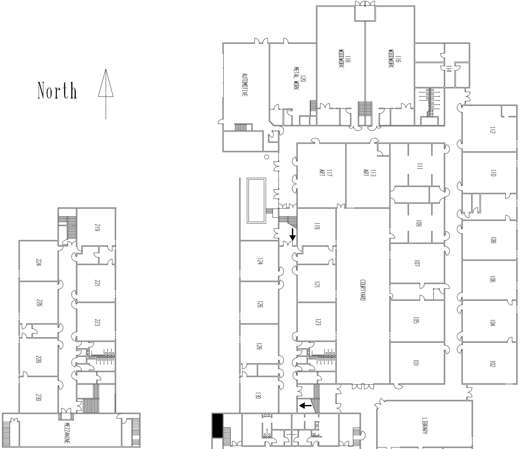
Second Floor: Above West Wing